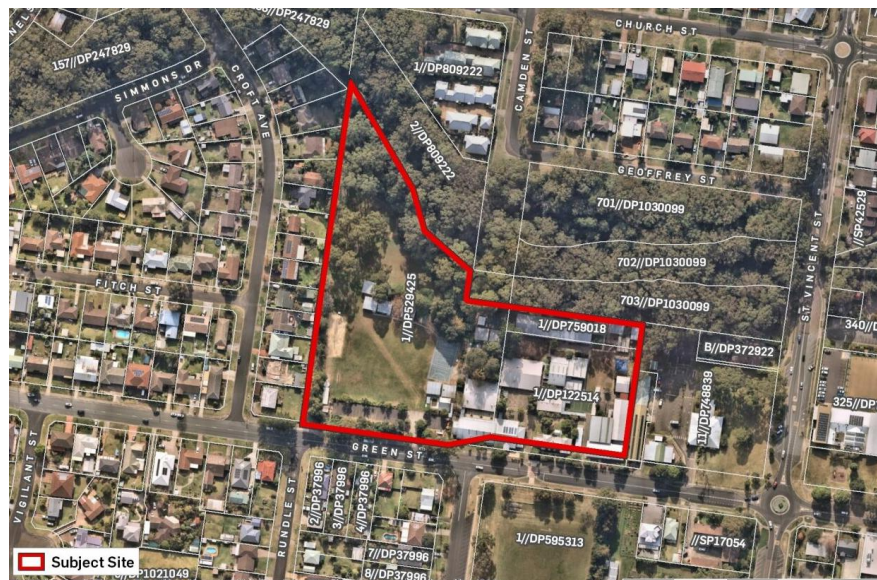
Figure 1 Aerial Photograph of the Site